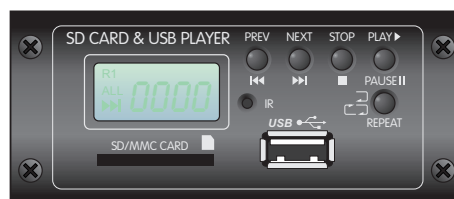
Detail of the optional module